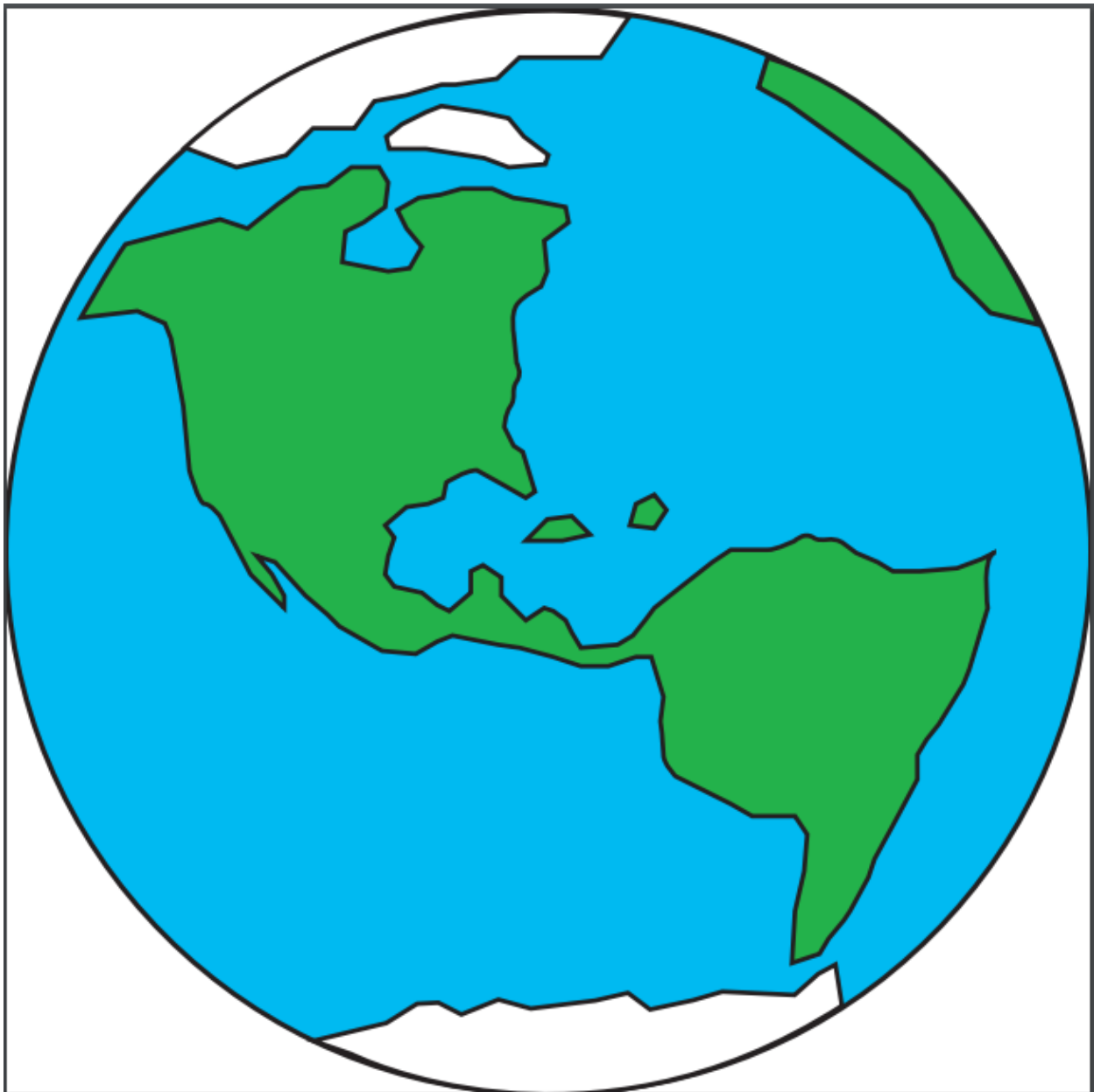
Earth Template 1

https://spaceplace.nasa.gov/stained-glass-earth/en/