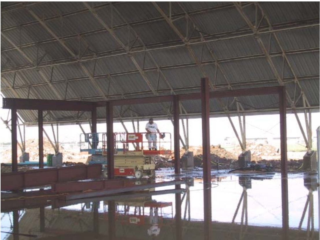
Finally going above ground verses under it