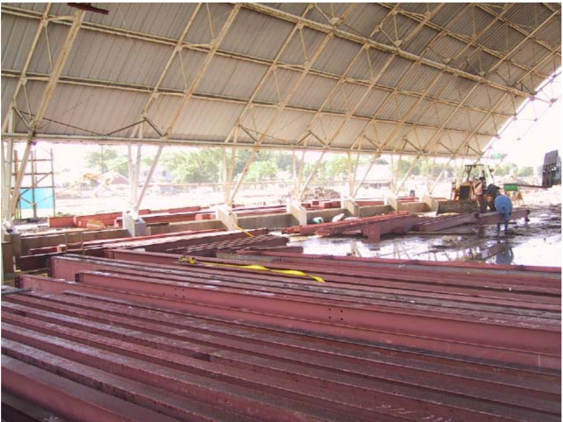
Steel staged for install!