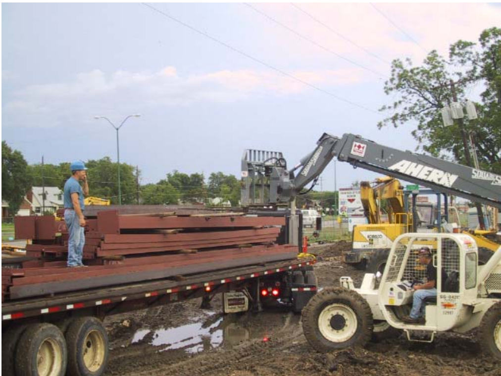
Unloading in the mud