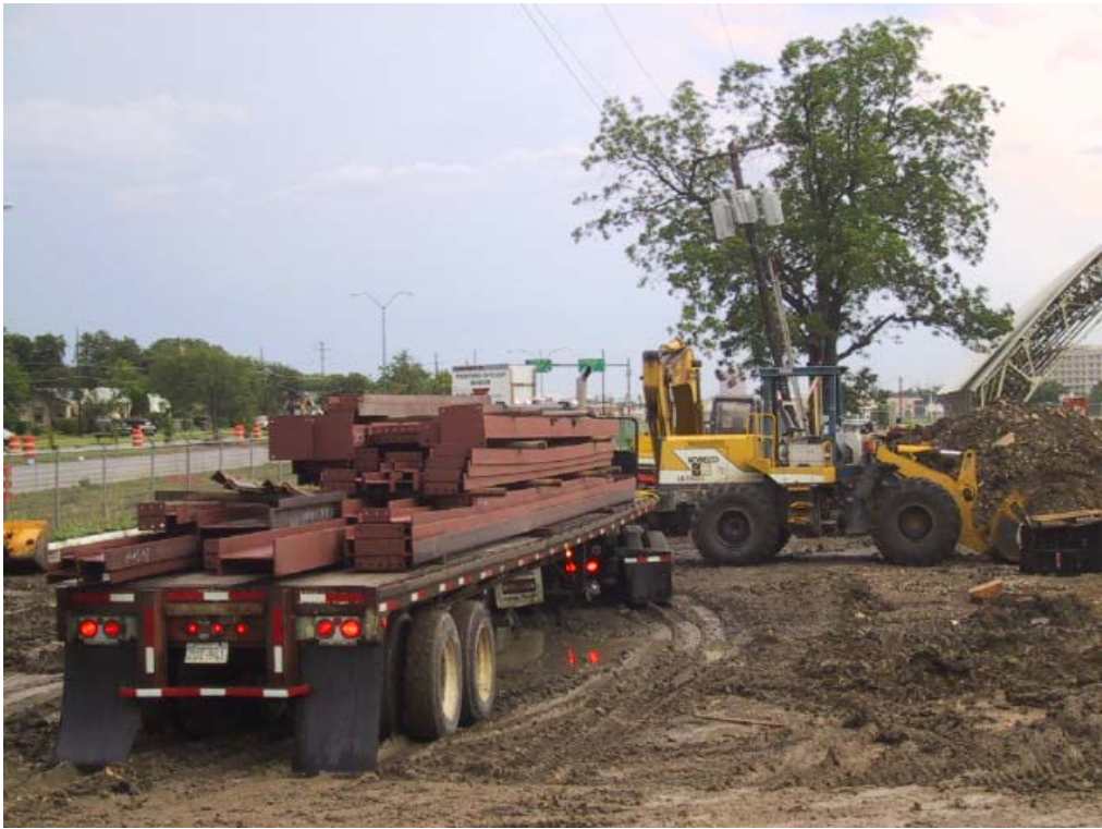
More steel arriving