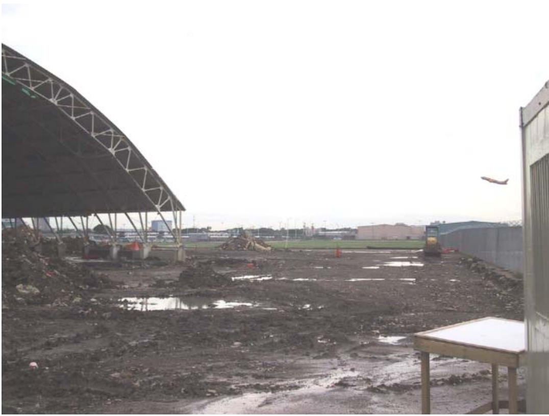
Storm water culvert finally covered over. Our mountain is gone!