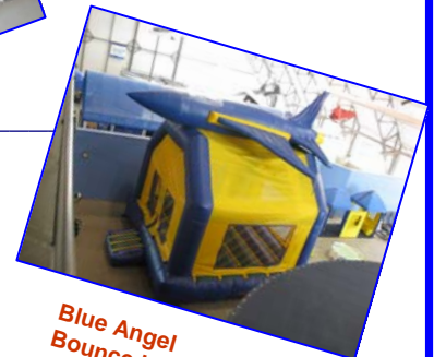
Blue Angel Bounce House

(this package includes fountain drinks for all your guests)